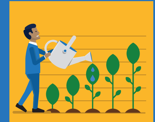
Start and grow easily

Connect your people and processes like never before