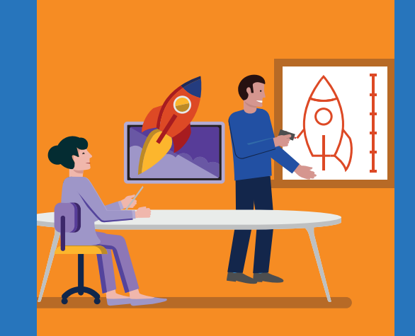
Make better decisions